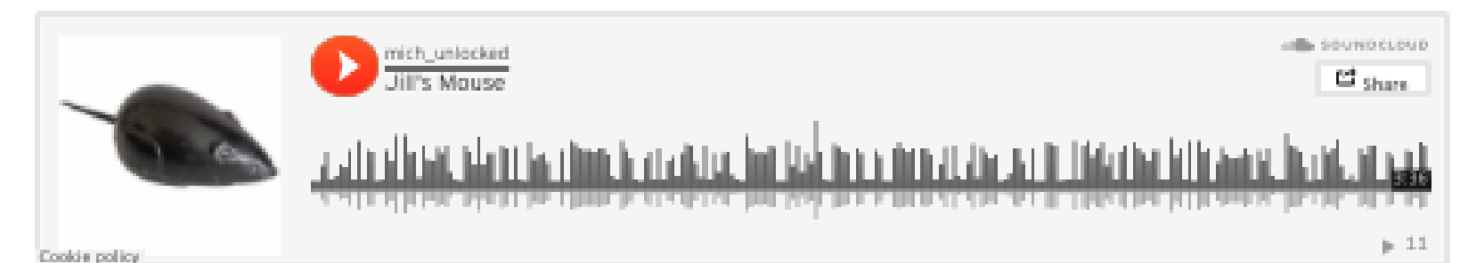
Click here to read about Jill's object – her mouse.